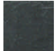
1103 CHARCOAL GRAY