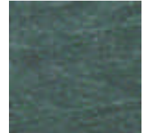
1102QX ANTIQUE GREEN

We offer a choice of shapes, including fish scale, rectangular and square. If you do not see the shape you need, let us know and we will provide custom shapes to fit your project needs.