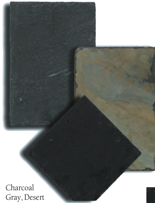
Charcoal Gray, Desert Storm and Ebony.

International Slate & Stone roofing tile are available in Antique Green,